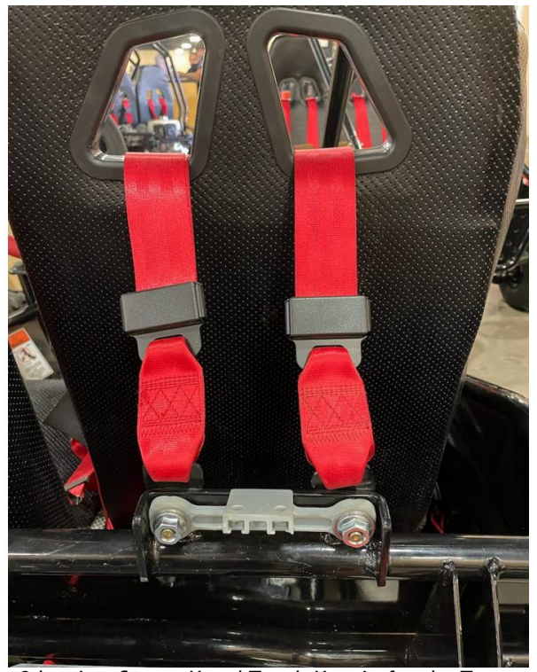
Image: 3D-printed go-kart parts printed with engineering 3d resins: Strong-X and Tough-X resin for the Torque Off Road TQ390.