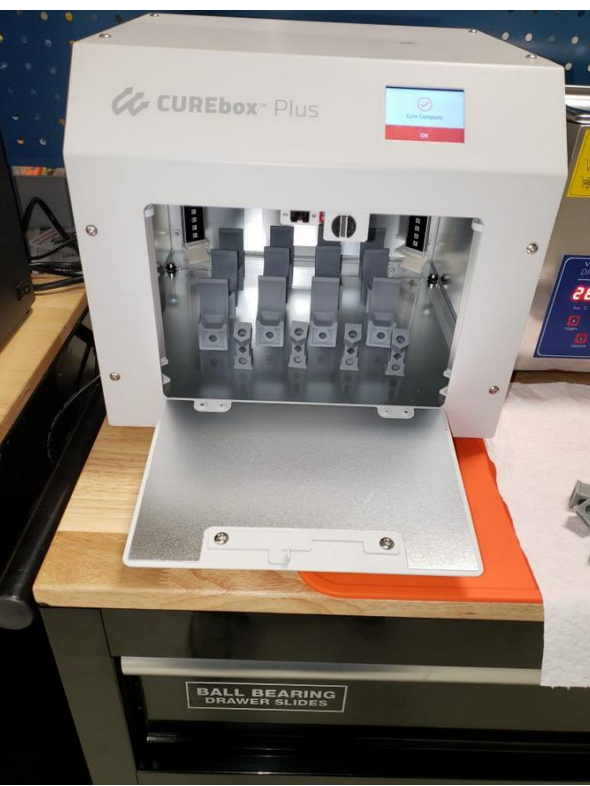
Image: printing parts in the <u>Epax3D X10</u> and post-curing engineering resin <u>Liqcreate Strong-X</u> in the <u>Wicked Engineering Curebox</u>.